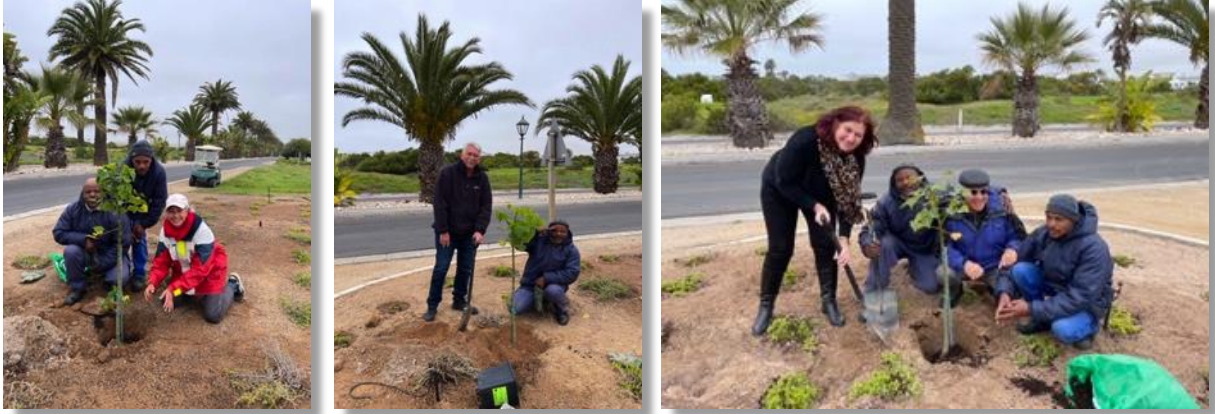
The tree planting day on 1 September

Public access to Shelley Point: (The following is an unedited document written by Prof. de Beer pertaining to Estate access).