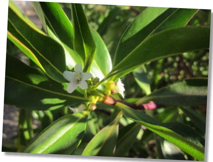
Myoporum insulare – pretty but nasty